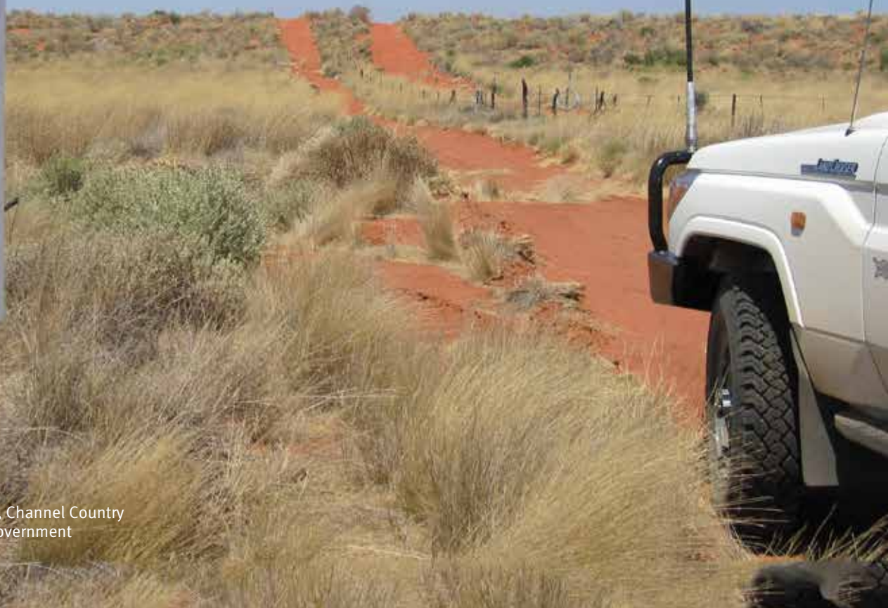
Ethabuka Nature Refuge, Channel Country