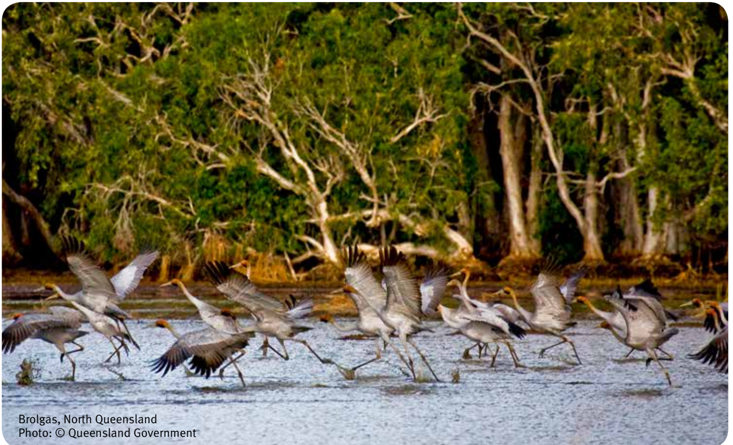
Brolgas, North Queensland