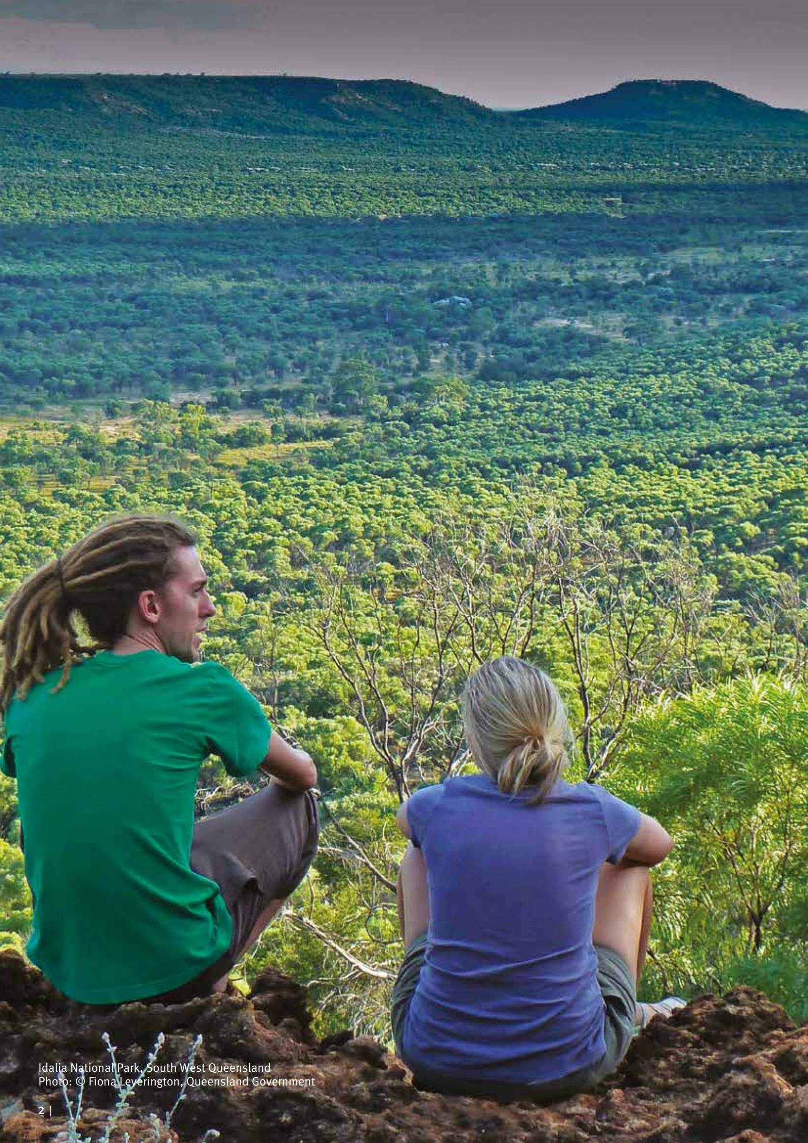
Idalia National Park, South West Queensland