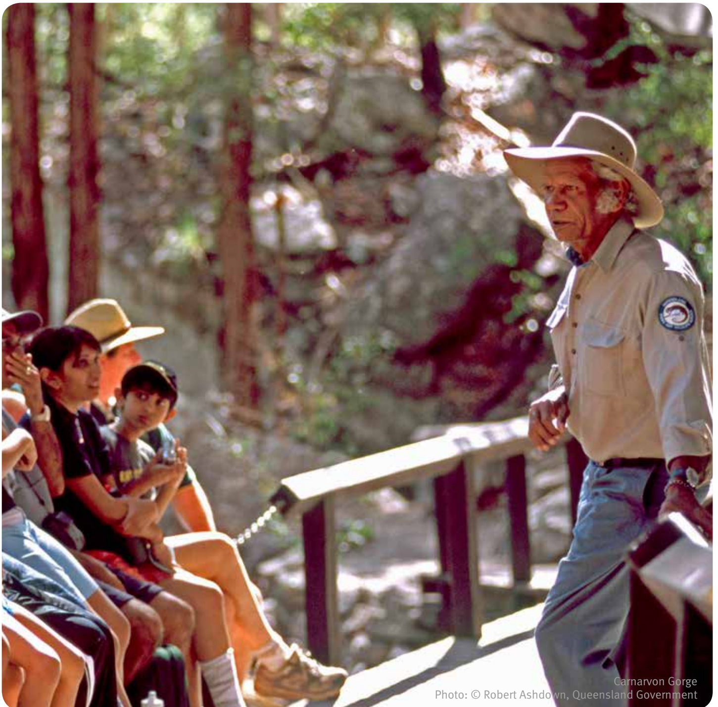
Carnarvon Gorge