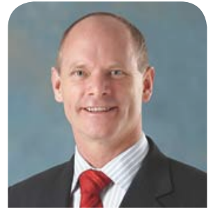
The Honourable Campbell Newman, MP Premier of Queensland

We encourage all organisations who can contribute to this work to do so.