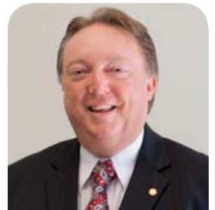
The Honourable Glen Elmes, MP Minister for Aboriginal and Torres Strait Islander and Multicultural Affairs and Minister Assisting the Premier