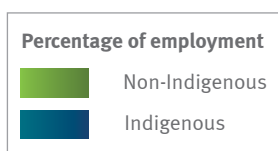
Figure 1: Employment rate for 25–64 year old Queenslanders by highest level of education attained, 2011

Source: Australian Bureau of Statistics, 2012, 2011 Census of Population and Housing, Commonwealth Government Canberra.